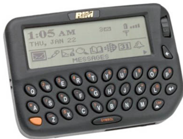
Figure 2: Research In Motion’s 850 Interactive pager.

“[W]e really haven’t changed the application or feature set in over two years. It’s pretty much maintained the original vision since Day One. And that really adds a lot of weight to the concept and how much desire there is for communication of this sort” [46].