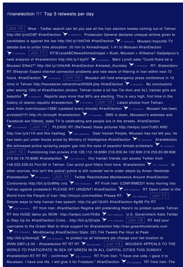
Figure 3a: For the ppl of Iran - #iranelection RT. Top 3 retweets per day, of tweets with #iranelection hashtag, 10-30 June 2009, in chronological order. Figure depicts 10-19 June.

from 10-30 June 2009 (see figures 3a and 3b). The top three retweets per day were captured and ordered by retweet count. All sets of retweets were placed in chronological order, as opposed to the reverse chronological order of Twitter and blogs more generally. The story of the events unfolds through retweets over the course of the twenty days: Mir-Hossein Mousavi holds an emergency press conference; the voter turn-out is 80%; Mousavi's website and Facebook page are blocked; police are using pepper spray; Mousavi is under house arrest, and declares he is prepared for martyrdom; Neda is dead; there is a riot in Baharestan Square; Bon Jovi sings "Stand by Me" (in Farsi) in support; Ahmadinejad is confirmed the winner, and a last tweet in the collection reads, light a candle for those who have died. In the retweets one takes note of many of the main storylines discussed above that mitigate Twitter's role in the 'revolution', and detail is offered about how the users reacted. There is the suspicion of infiltration and the call for an act of solidarity to change user location to Iran, as we have seen. The Internet is filtered, and subsequently proxies and anonymisers are offered. There is violence in the streets, and first aid as well as digital witnessing pointers are given. In a sense it's an event aid space, which other researchers have found, in their studies of disasters (Bruns and Liang, 2012).