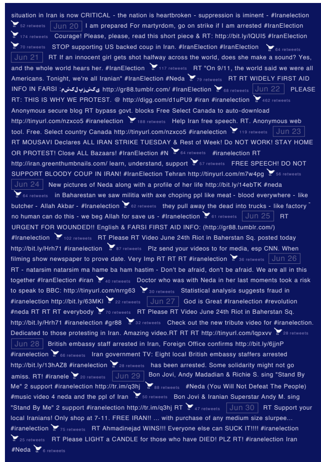
Figure 3b: For the ppl of Iran - #iranelection RT. Top 3 retweets per day, of tweets with #iranelection hashtag, 10-30 June 2009, in chronological order. Figure depicts 20-30 June.

The question of whom Twitter aids and abets, so to speak, has arisen in studies of its use during the London riots of 2011, where Twitter became both a fomenting as well as a rumor machine. A conservative British politician called for Twitter as well as Facebook to be blocked, as one may suspend rail service during an emergency [7]. Twitter apparently was being used to foment the riots, and also to spread rumors. In response to calls for a temporary blackout of Twitter, Biz Stone, Twitter co-founder and pioneer of the what's happening tagline, pointed to his post, "The tweets must flow," which provides a freedom of expression rationale for service continuation in times of trouble, and also an additional data point concerning their transparency project. Biz Stone: "We submit all copyright removal notices to @chillingeffects and they are now Tweeting them from @ChillFirehose" [50]. The claim that Twitter abetted the rioters and the rumor-mongers prompted study. Tonkin et al. found that "there is little overt evidence that Twitter was used to promote illegal activities at the time" [54]. The celebrated interactive data visualization in the Guardian, fashioned on the basis of the research by Procter et al. shows that Twitter is in fact more a rumor-quashing machine, providing correctives to such tales as: "rioters attack London Zoo and release animals," and "Rioters cook their own food in MacDonald's" [20] (see Figure 4).