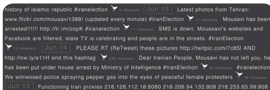
Figure 2: Segment of ‘For the ppl of Iran—#iranelection RT.’ Top 3 retweets per day, of tweets with #iranelection hashtag, 10–30 June 2009, in chronological order.